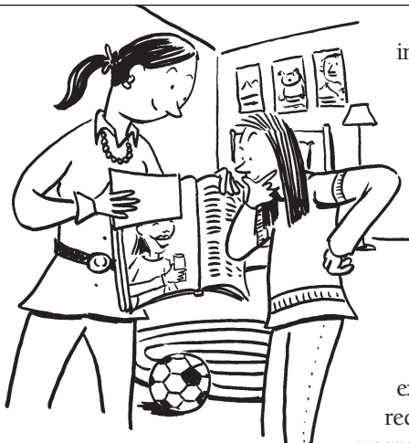
image the company is portraying (example: "Good-looking and popular people drink our soda").

Activity: Cover up brand names in ads. See if your middle grader can guess what they're selling. She may be surprised by how much they focus on attractive models or funny situations rather than on the products. Ask her what